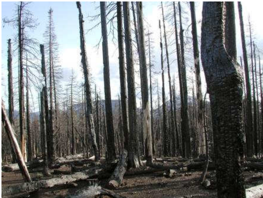
The Pacific Crest Trail, Mount Jefferson Wilderness Area, 2004. In addition to being unsightly and dangerous due to the threat of falling limbs, trees and reburning, much of this trail segment has been closed or difficult to traverse since the 2003 B&B Fire Complex.

To date, our own findings paint a far different picture than that commonly reported by the media or understood by the public. We have found that total short-term and long-term cost-plus-loss attributed to wildfires typically attains amounts that are ten to 50 times (or more) reported suppression expenses.